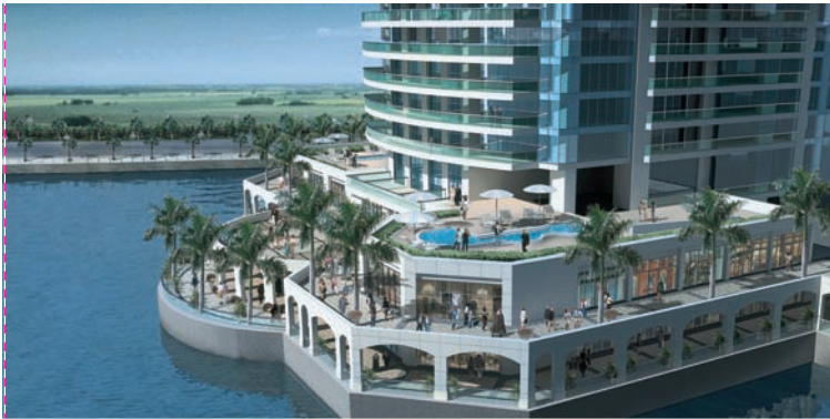
Mövenpick Hotel & Residence Jumeirah Lakes Towers Dubai